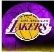
Sports Day: Andres